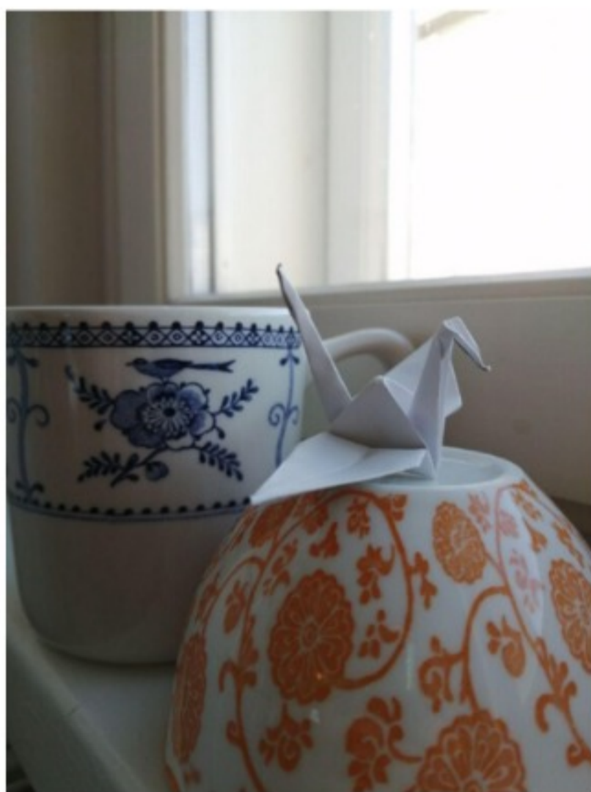
Topic: Early Bird